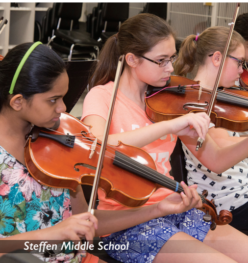
Steffen Middle School