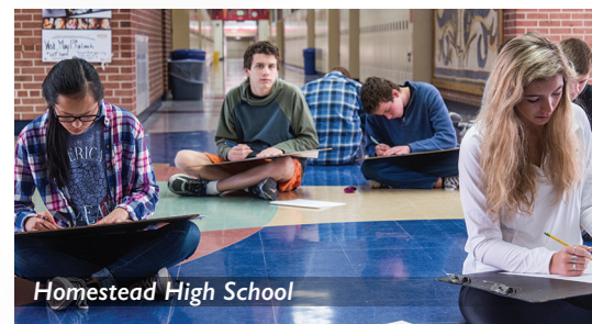
Homestead High School