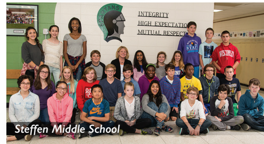
Steffen Middle School