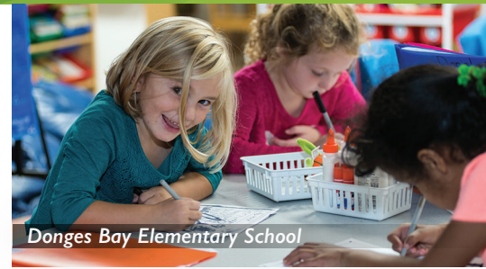
Donges Bay Elementary School

The Foundation is committed to helping address the budgetary shortfalls and to ensuring that the Mequon-Thiensville School District advances in technology, curriculum, and personnel. Declining enrollments coupled with the unfavorable state funding formula make this a fiscally challenging time for the Mequon-Thiensville School District. Creation of strong private-public partnerships empowers supporters of public education to partner to make a difference as we prepare our students for the 21st century global world.