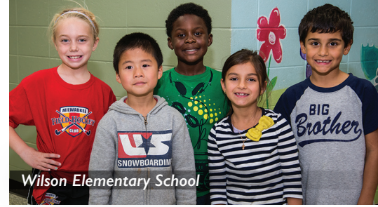
Wilson Elementary School