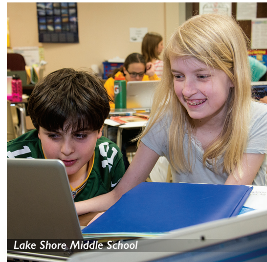
Lake Shore Middle School