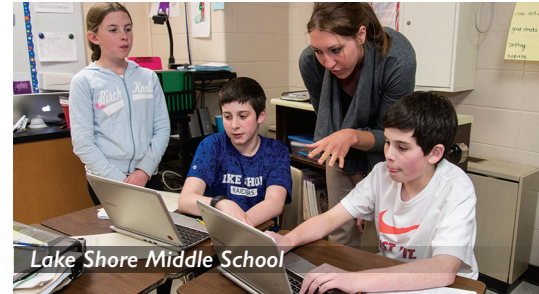
Lake Shore Middle School