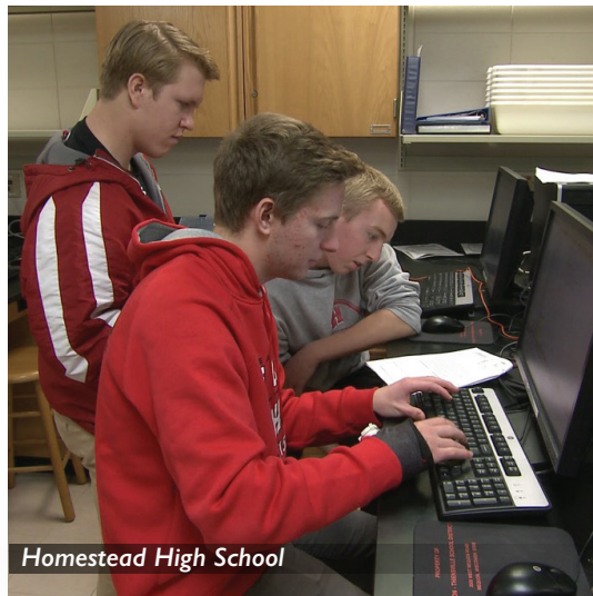
Homestead High School