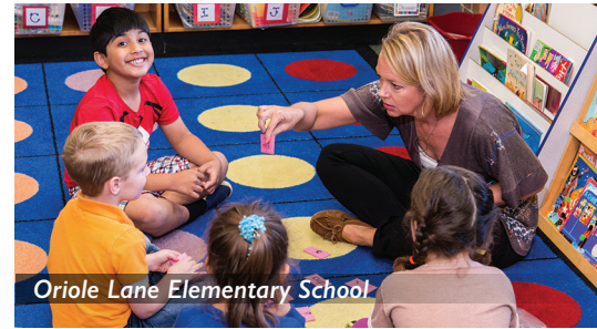
Oriole Lane Elementary School