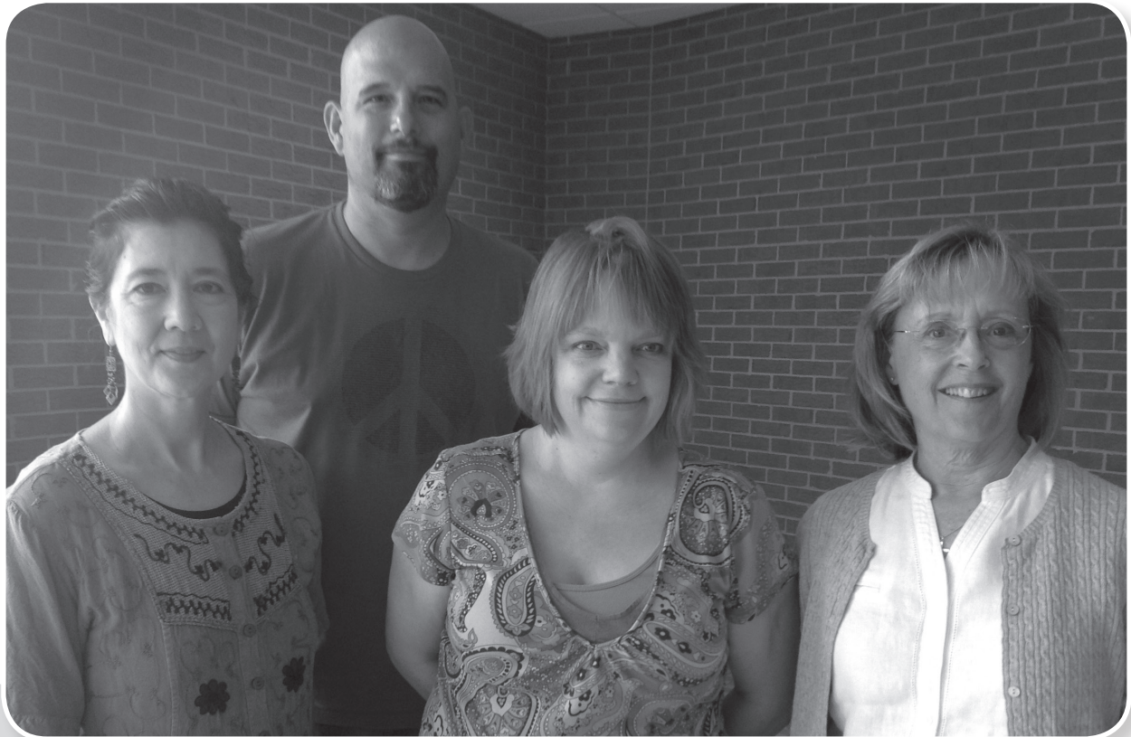
2013 Excellence in Teaching Award winners – (from left to right)